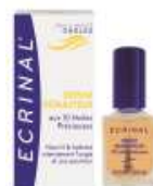
ECRINAL Nail Repair Serum with 10 Precious Oils 10 ml EAN 3323034808358