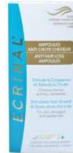
ECRINAL Anti Hair Loss Ampoules 8 x 5 ml EAN 3323030000251