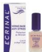
ECRINAL Flexible Base Coat 10 ml EAN 3323037743571