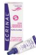
ECRINAL Nail Growth Care 10 ml EAN 3401560181470