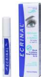
ECRINAL Eyelash & Eyebrow Strengtheners 9 ml EAN 3323036009647