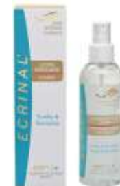
ECRINAL Fortifying Lotion - Women 200 ml EAN 3323030000312 Fortifying Lotion - Men EAN 3323030000350