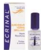
ECRINAL Clear & Shiny Top Coat 10 ml EAN 3323037743588