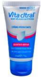
VITA CITRAL Moisturizing Hand Cream 100 ml EAN 3323035173929